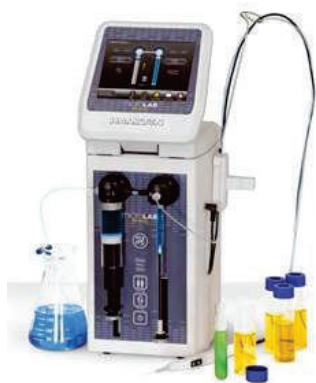
Diluidor (seringa dupla)