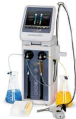
Dispensador (seringa dupla)