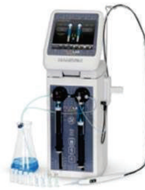
Dispensador (dispensa contínua)