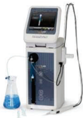
Dispensador (uma seringa)